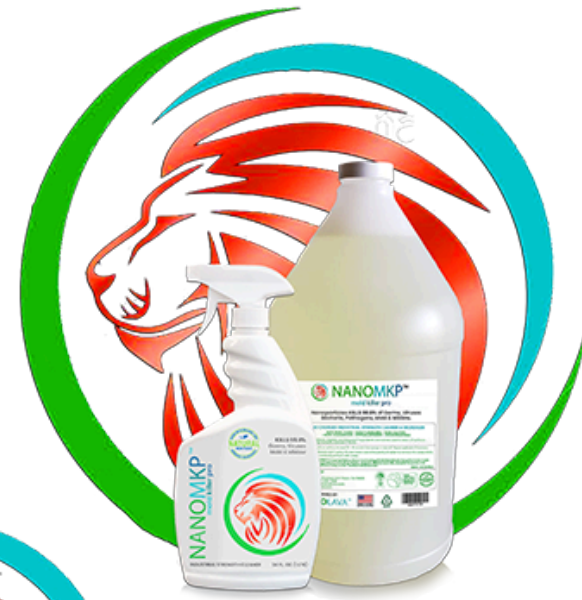
NANOMKP™ mold killer pro