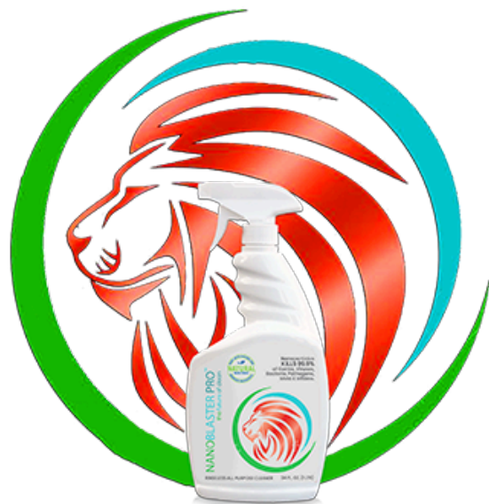
NANOBLASTER PRO™ nano-charged all purpose cleaner

NANOBLASTER™ PRO 's ingredients meet criteria for the US EPA Design for the Environment Program and the Safer Detergents Stewardship initiative, and contain NO harmful or toxic chemicals including: Chlorine, Ammonia & Biocides. None of our ingredients appear on the California Proposition 65 or Canadian CEPA-DSL lists.