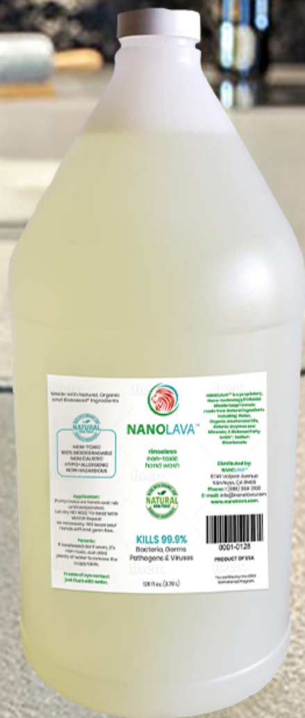
128 Oz. REFILL