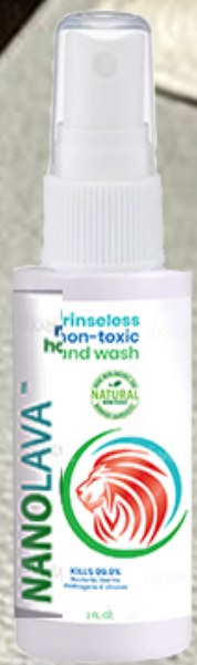
2 Oz. SPRAY