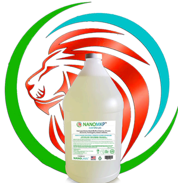
NANOMKP™ mold killer pro