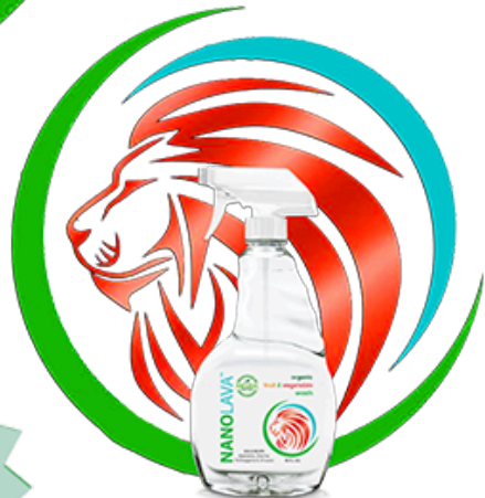
NANOLAVA™ fruit & vegetable wash