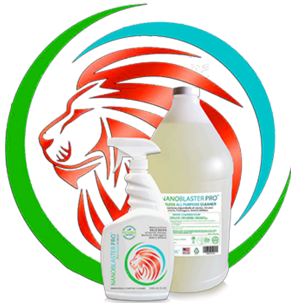
NANOBLASTER PRO™ nano-charged all purpose cleaner