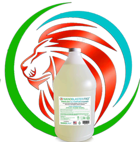
NANOBLASTER PRO™ nano-charged all purpose cleaner