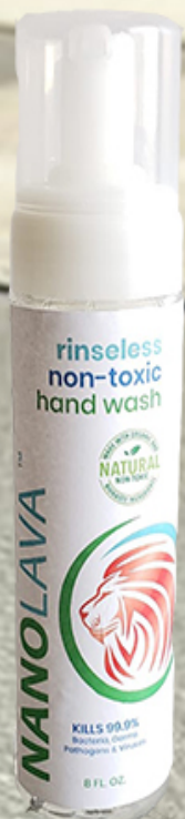
8 Oz. FOAM