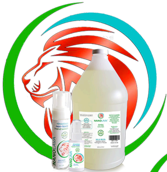
NANOLAVA™ rinseless hand wash